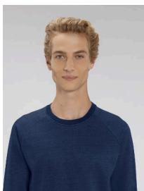
Stanley Stroller Denim